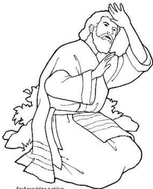
Saul receiving a vision on the road to Damascus