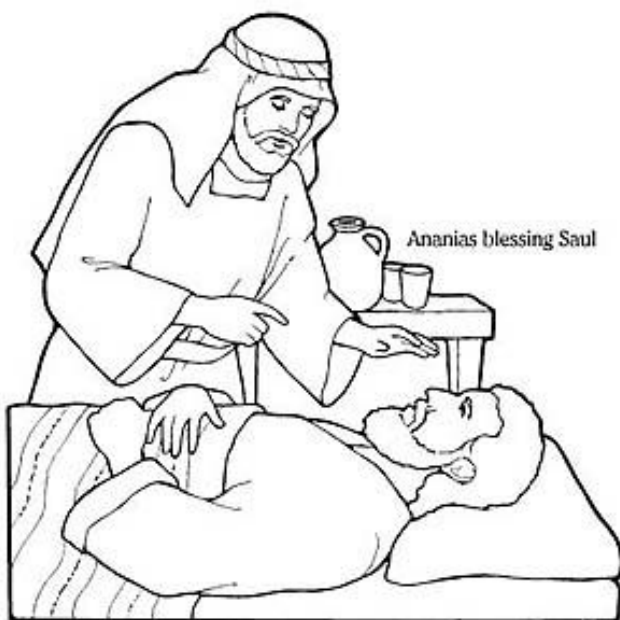
Ananias blessing Saul